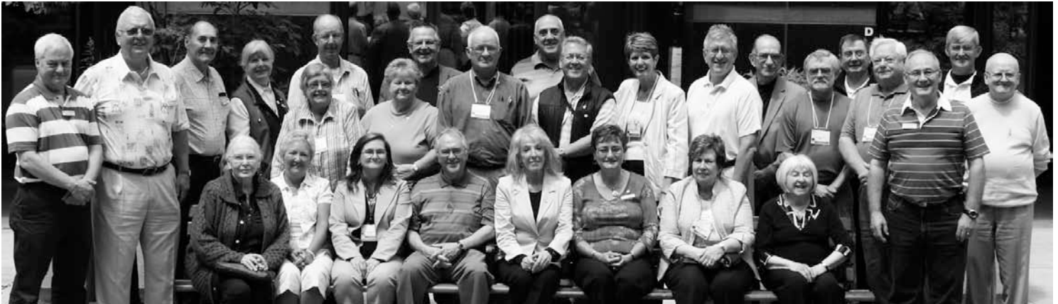
2010 ACER/CART Delegates

204-2281 Portage Ave., Wpg., MB R3J 0M1 • Phone 889-3660 • 1-888-393-8082 • Email:rtam@mts.net • www.rtam.mb.ca