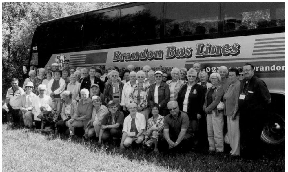
2010 Southwest Assiniboine Chapter of Retired Teachers' Tour Participants - June 15.